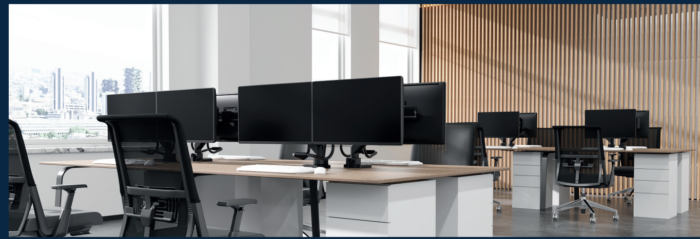
Prestigious projects and installations

We don't just connect locations; we connect opportunities. Our worldwide organisation is able to fulfil our mission to offer our channel partners local support on a global scale. Being close to our individual customers at all times and allowing us to support global partners and projects, wherever the location.